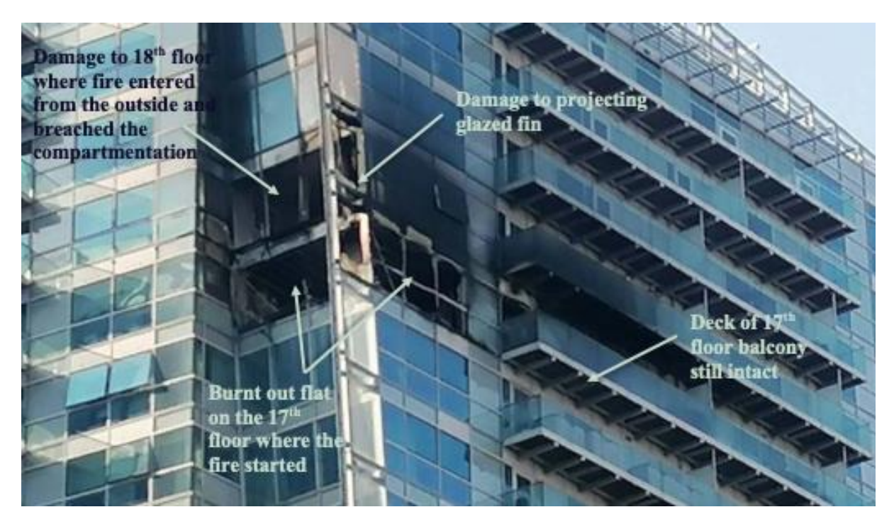
Figure 6: The Relay Building after the fire has been extinguished, where there is damage to both the 17<sup>th</sup> and 18<sup>th</sup> floors.

the level of risk. With only the balconies "remediated," the fire risk from the curtain walling system will remain, even if the building is signed off as no longer being a risk, thus allowing residents to once again be able to sell their flats. It should be emphasised at this point that the balconies were not the only means of fire spread during this incident, and the curtain wall system itself had at least as much of a role in the fire, if not more so. Therefore, the risk of injury or loss of life will not be eliminated by the replacement of the balcony decks, and the level of reduction of the overall risk will not be reduced to an acceptable level.