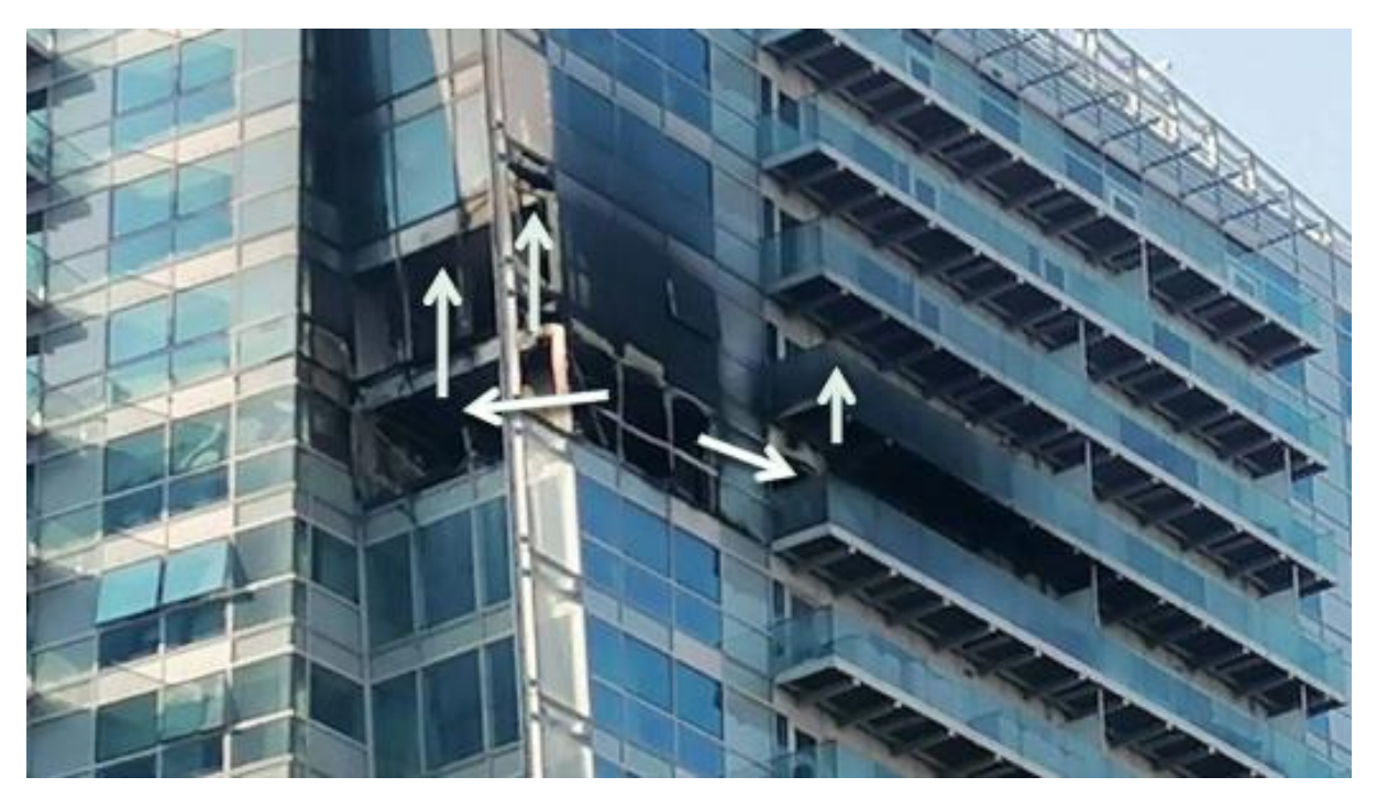
Figure 7: This is a repeat of Figure 6 , but with the purpose of showing the various paths the fire took as it spread through the curtain walling system.

*The effect of building geometry upon fire is described in detail in the report, "The Relationship between Building Design and Fire Spread: How the Shape, Form & Features of a building can influence the behaviour of fire."