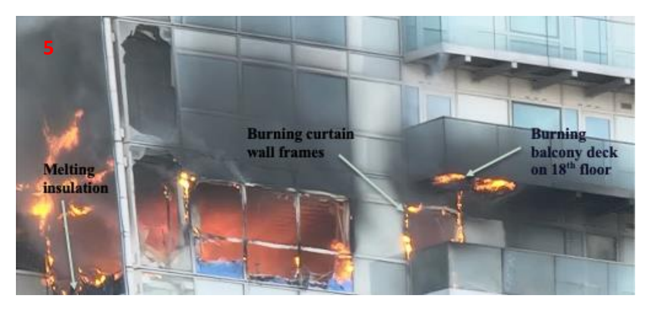
Figures 3 - 8 are all in the public domain and were taken from articles published by the BBC, The Sun newspaper and the World Socialist Web Site (WSWS.org), via a Google-based search for images

3.2 The apartment involved was not a housing association property, but one of the higher end flats created in 2014. The development of the fire is documented in the photos ( Figs.3, 4 & 5 ) and paragraphs below. It began high up in a flat on the south-east corner of the building and developed rapidly, causing the glazing to fail on both the southern and eastern sides.